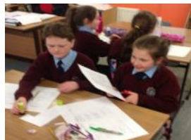
P6 and P7 Show Their Maths Skills to Visiting Teachers from St. Patrick's High School Maths Department

Summer Vacation School Closes Fri 26th June.